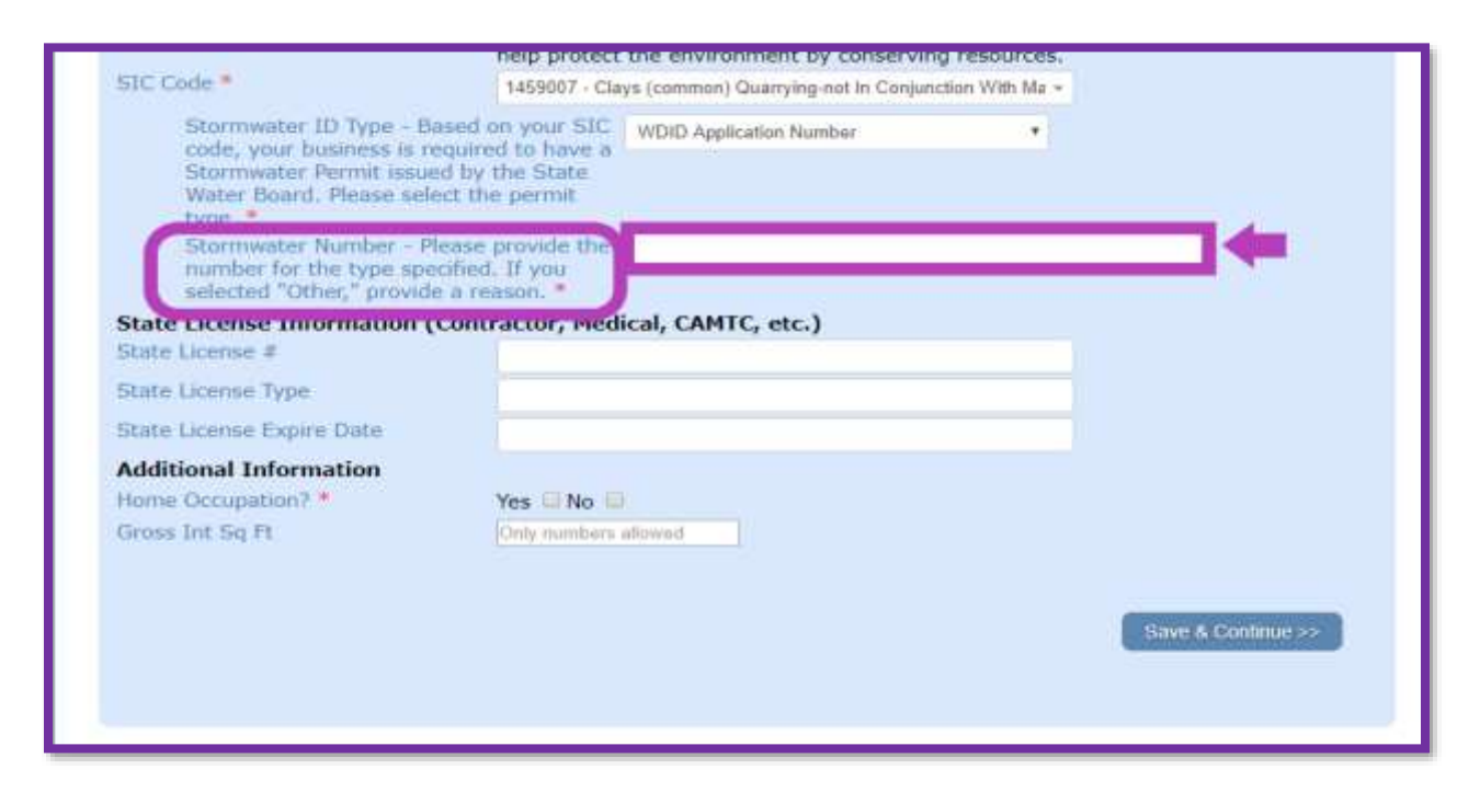
Step 3 . Complete your application/renewal process, review and submit.

Once the permit type is chosen, you will then be required to enter the permit or application number. If "other" was chosen, you will be required to provide a reason in this field.