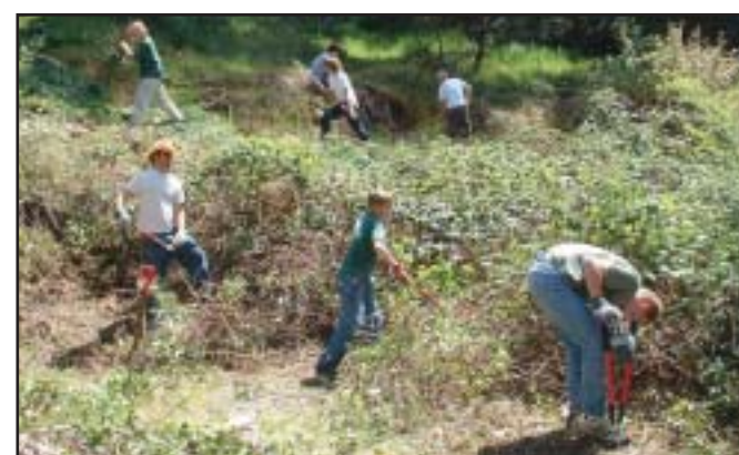
Grass Valley Charter School at Glenn Jones Park