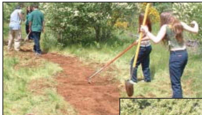
3R Students at Mautino Park

This spring students from local schools contributed numerous hours of their time assisting with projects that have benefited the City's Parks. 3R School spent a total of 3 days planting Daffodil bulbs, pruning fruit trees, and building a trail at the future site of Mautino Park. Grass Valley Charter School students came out to Glenn Jones Park on 5 separate occasions to remove blackberries along Wolf Creek and replant the area with native plants. Their efforts and wide variety of skills are greatly appreciated.