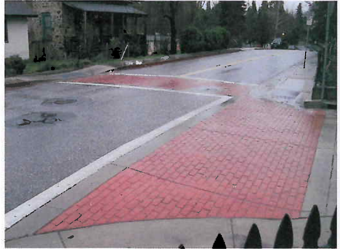
- VIEW - Mill and Walsh Streets (looking south)

Annual sidewalk and accessibility improvements - locations vary.