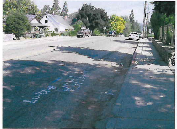
- VIEW - South Auburn Street (looking north near Empire Street)

The American Recovery and Reinvestment Act (ARRA) of 2009 resulted in the City of Grass Valley receiving $506,565 to perform digouts, construct curb ramps, repair sidewalks and overlay South Auburn Street from Tinloy Street to McKnight Way.