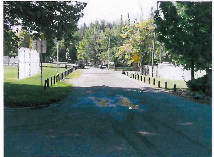
- VIEW - Entrance to Memorial Park (Central Avenue)

Construct sidewalk into Memorial Park to improve park accessibility.