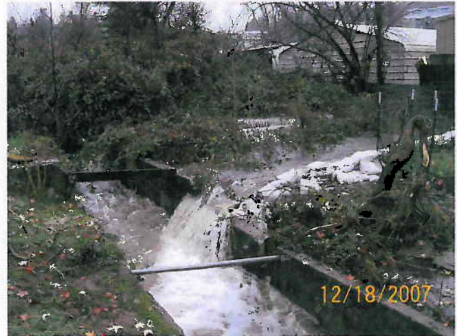
- VIEW - Matson Creek (looking north from Eureka St.)

During severe storms in 2008, Matson Creek and the Main Street storm water collection system experienced damage. Assistance has been approved by the California Office of Emergency Services for 75% of the cost of the Matson Creek repairs and 75% of the cost for the Main Street storm water collection system.