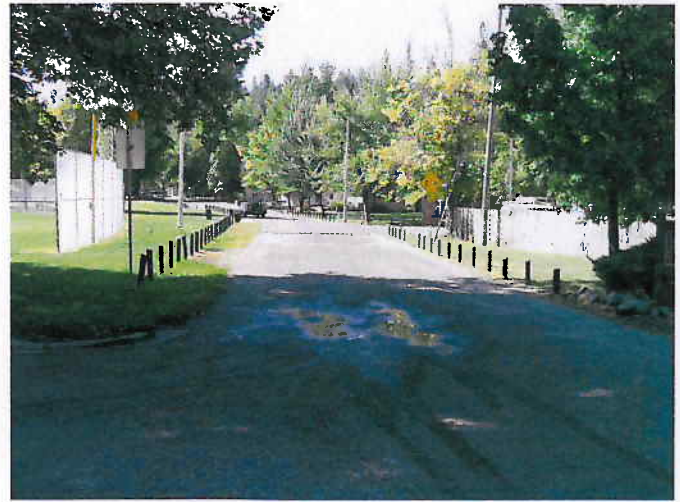
- VIEW - Entrance to Memorial Park (Central Avenue)

Construct accessibility improvements to Memorial Park on Oak Street and Central Avenue and to Condon Park on Minnie Street.