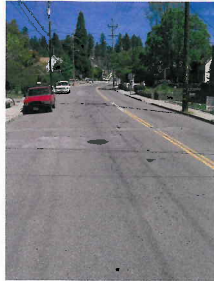
- VIEW - West Empire Street ( looking east)