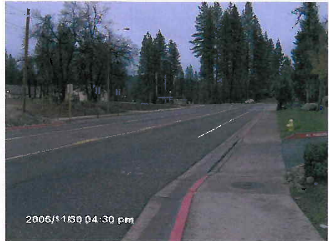
- VIEW - SUTTON WAY (looking south)

Construction of curb, gutter and sidewalk from 205 Sutton Way to Plaza Drive and addition of a crosswalk.