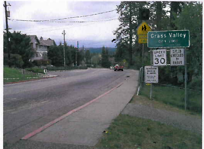
- VIEW - West Main Street (looking east as entering town)

Safe Routes to School Project to replace curb ramps, slurry West Main Street, add striping for traffic calming and bicycle lanes, and construct pathways on Lyman Gilmore's campus and to Condon Park.