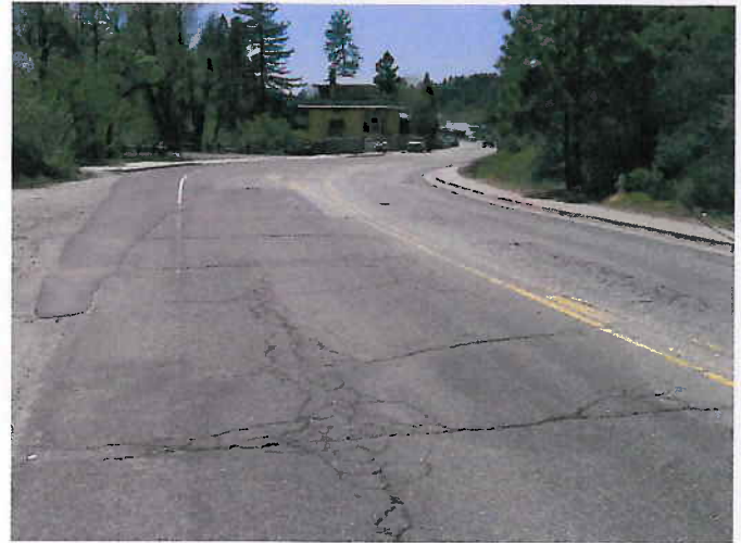
- VIEW - Idaho-Maryland Road (looking west)