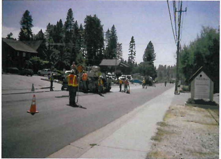
- VIEW - East Main Street (looking south towards Presley Way)

Street sweeper tailings disposal, striping maintenance and updating the City's Pavement Management System.