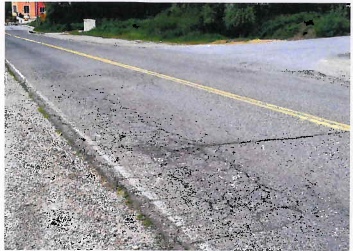
- VIEW - Sutton Way (looking south)