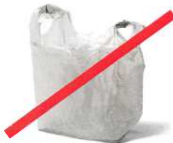
Single-use plastic carry-out bags are prohibited in Grass Valley retail stores.