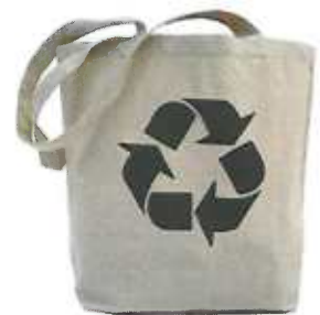
Reusable bags will be encouraged for Grass Valley shoppers.