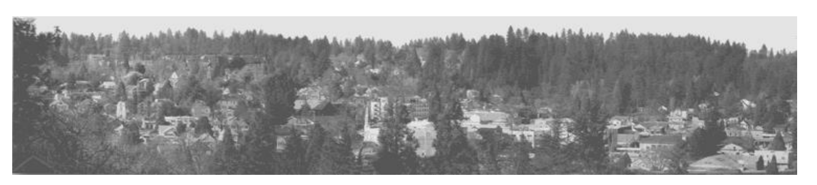
Adopted by Resolution No. 2019-48 on August 13, 2019